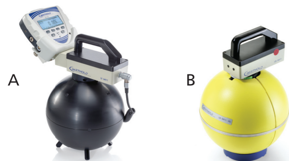
Figure 1: Different versions of the LB 6411. A: Mobile measuring system setup connected to the LB 134 Umo II Universal Monitor. B: LB 6411-Pb version for high energy applications

The probe is characterized by an extremely high sensitivity of approx. 3 pulses per nSv, more than 5-times better vs. detectors with conventional design. This was achieved by the relatively large detector volume and a special gas filling of the proton counter tube. Thus, additional recoil protons are produced in the counting gas, resulting in enhanced sensitivity.