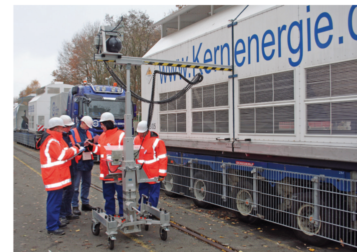
Figure 3: Neutron measurement during CASTOR transport

The LB 6411 operates virtually independent of the radiation direction. This is made possible by the optimized spherical geometry of the moderator and counter tube. In the energy range between 1 MeV and 20 MeV, it results in a directional deviation of less than \pm 10\% from the preferred direction over the entire angular range. In the lower hemisphere the directional dependence remains below 10% even at low neutron energies.