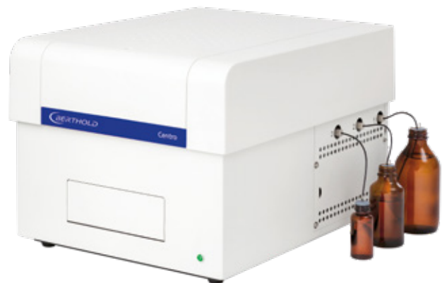
The optional injectors are integrated into the housing of the system to save precious bench space.